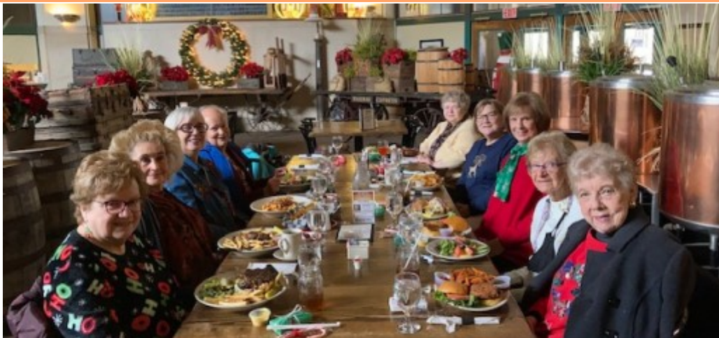
Ladies enjoying a relaxing, fun and laughter filled Christmas luncheon at BrewErie at Union Station Dec 8